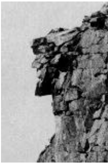
New Hampshire's Old Man of the Mountains

In 1976, two Viking space probes arrived in orbit around Mars. Soon a picture came back of a mile long rectangular hill in the region of Mars known as Cydonia. The hill was unusual because in the late afternoon light, the shadows made it