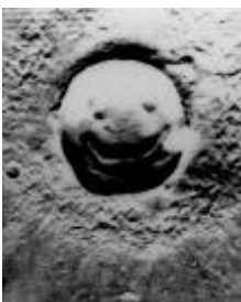
A Smiley Face?

The mystery is now unraveling. In 1998 scientists had Mars Global Surveyor pointed the probe's high-resolution cameras at the enigmatic Face on Mars that can be seen in the photo below. Compare the newer picture below with the earlier Viking image above. Higher resolution and different lighting make the landform appear quite differently.