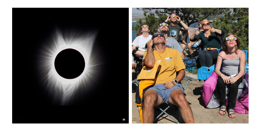
Total Solar Eclipse and eclipse watchers wearing eclipse glasses, August 21, 2017.

Do not look directly at the Sun anytime , even during an eclipse, without a proper solar filter such as eclipse glasses. Sunglasses are not adequate or safe protection! The black circle in the middle is the Moon, the white light around it is the Sun's corona (outer atmosphere).